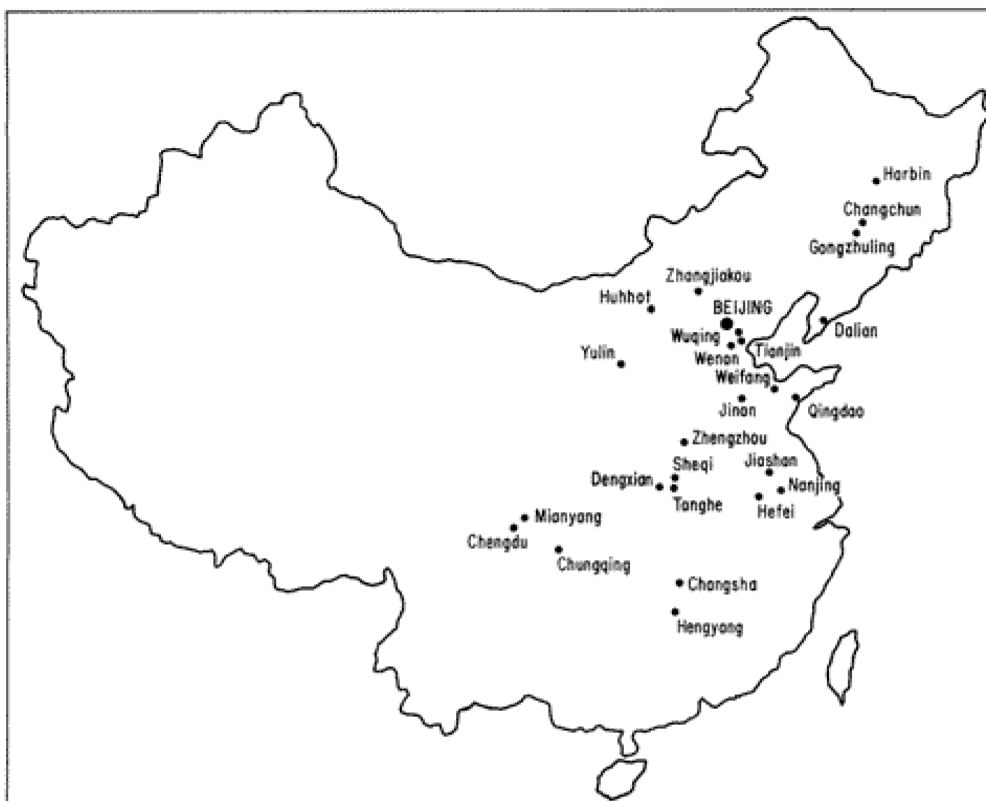
Figure 1. Mungbean trials throughout China (1983-1988)