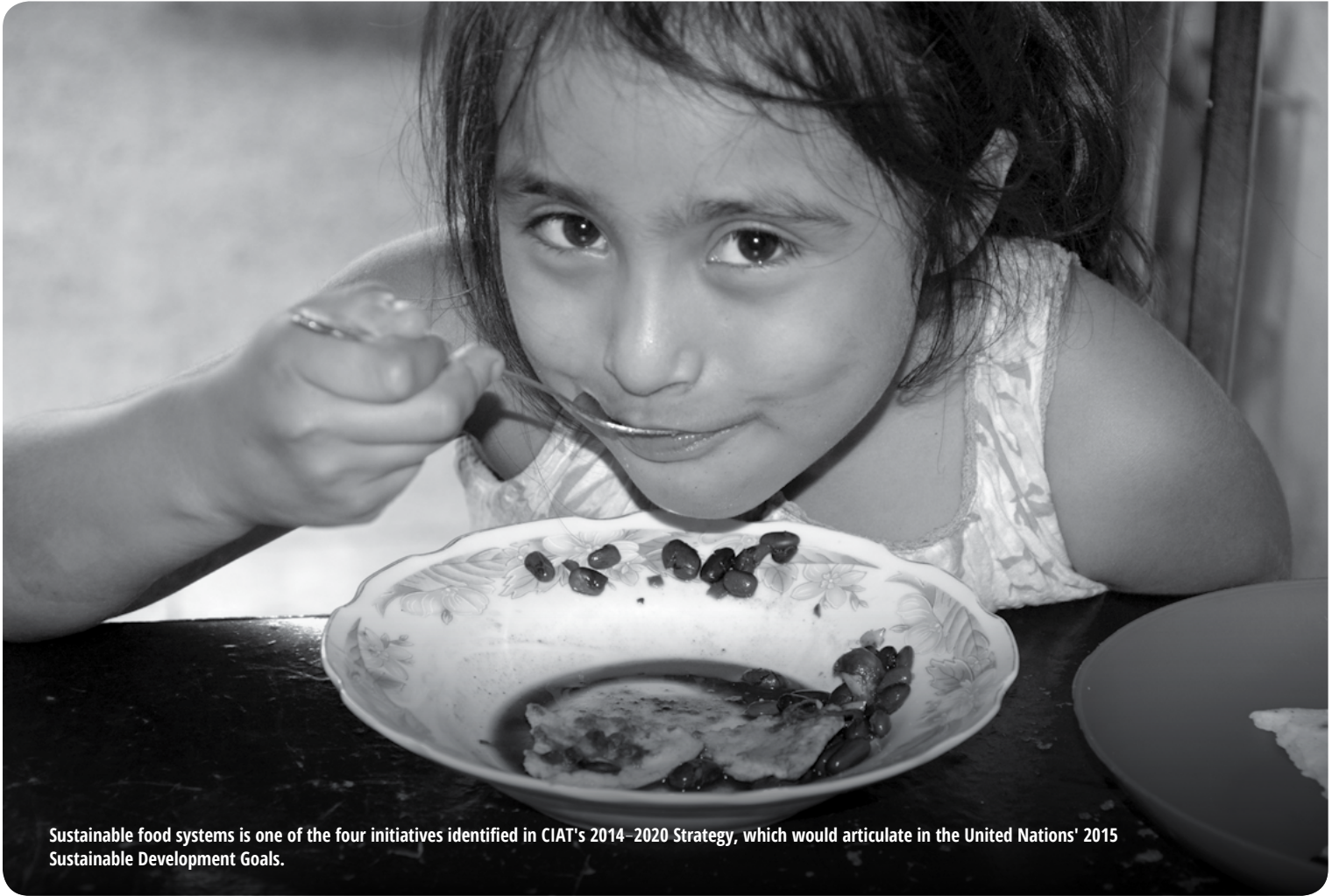
Sustainable food systems is one of the four initiatives identified in CIAT's 2014–2020 Strategy, which would articulate in the United Nations' 2015 Sustainable Development Goals.