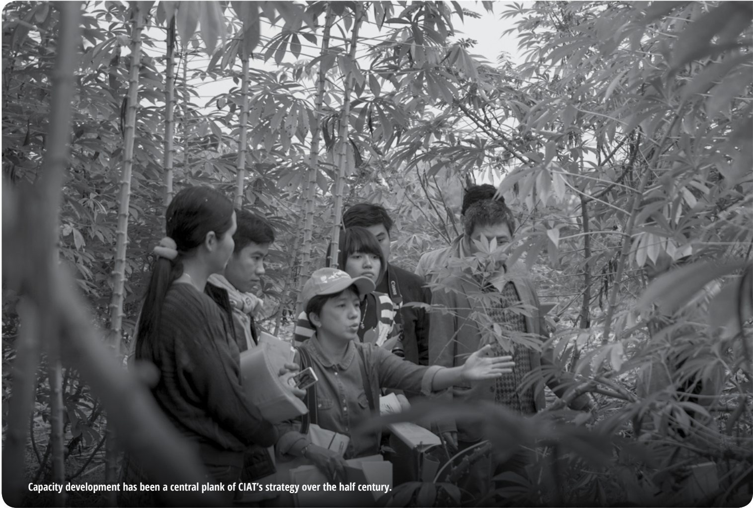
Capacity development has been a central plank of CIAT's strategy over the half century.