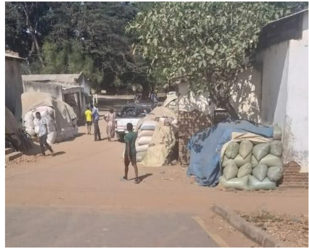
Farmers and traders stack their maize waiting for ADMARC to buy from them at Mwenitete ADMARC in Karonga

No ADMARC purchases were reported in the last 3 weeks of September in the markets monitored by IFPRI. ADMARC is reported to have run out of the funds to continue buying maize. Some farmers and traders report to have stacked their maize outside ADMARC depots at a reported cost of MWK100 per bag per night to guard the maize until ADMARC buys from them. Old maize is now being sold to consumers by ADMARC at MWK 205/kg.